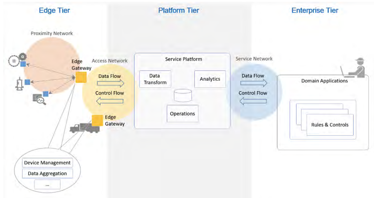
Exhibit 2: IIC three-tiered architecture for Smart Factory Web.

As shown in Exhibit 2, the Smart Factory Web applies a dual plane three-tier IIC implementation architecture with IIoT technologies on both planes.